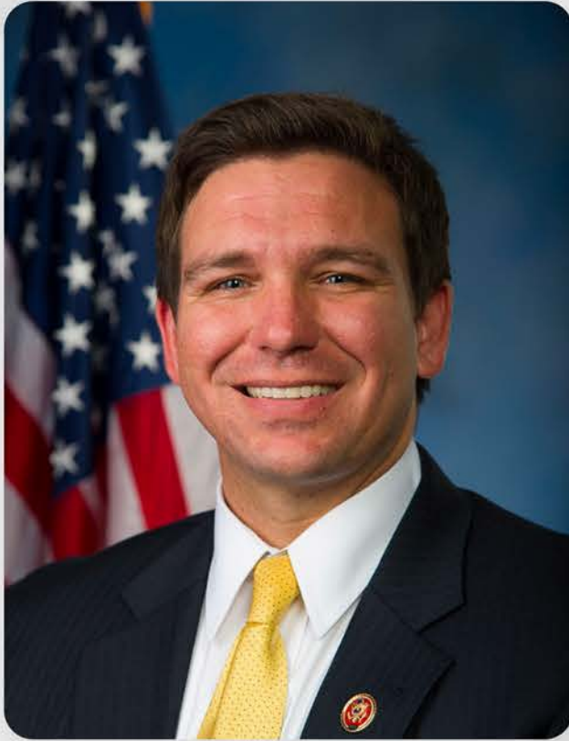
Governor Ron DeSantis